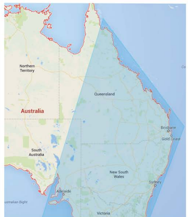
Malcolm & Maya photograph in the shaded area on this map.

You can make $60 - $80 for every family you book for us to photograph in either the Box or Black on Black style. Kidshotz specializes in fundraising photography in small towns throughout Eastern Australia. We can only manage to photograph about 50 events a year so get in quick.